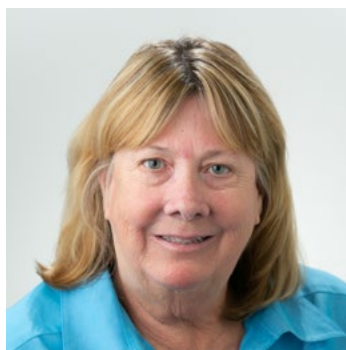
Lambda University of California, Berkeley